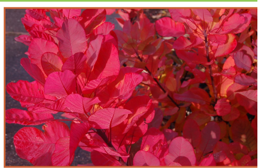
Image: Old Fashioned Smoke Bush PBR entered in fashion show by UpShoot, LLC.

New plants will rock the fashion show runway!